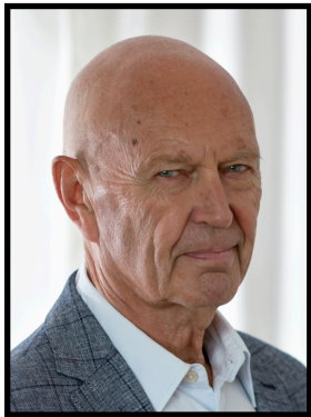
Pierre Schori Swedish Ambassador to the United Nations (2000-2004)