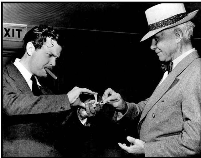
Orson Welles & Carl Sandburg, 1942.